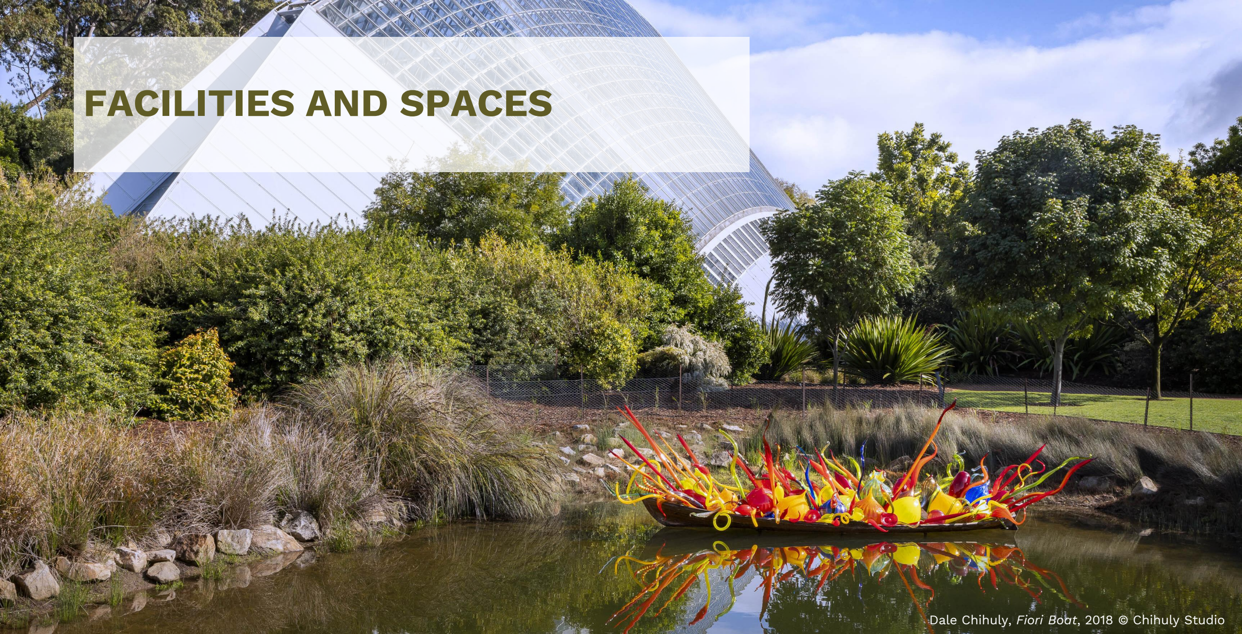
Dale Chihuly, Fiori Boat , 2018 © Chihuly Studio