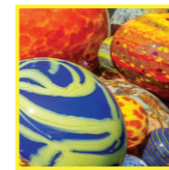
3 Dale Chihuly Float Boat and Nijjima Floats, 2012-19