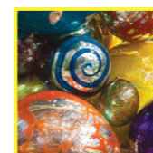
8 Dale Chihuly Polyvitro Chandelier, 2006