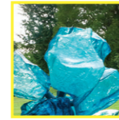
2 Dale Chihuly Blue Crystal Tower, 2024