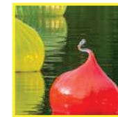
13 Dale Chihuly Walla Wallas, 2024