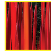
1 Dale Chihuly Red Reeds on Logs, 2024