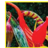
12 Dale Chihuly Fiori Boat, 2018