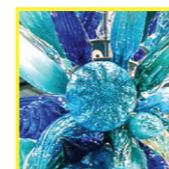
6 Dale Chihuly Glacier Ice and Lapis Chandelier, 2024