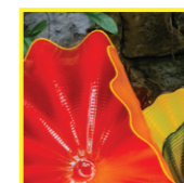
14 Dale Chihuly Ethereal Spring Persians, 2022