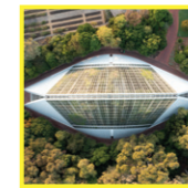
11 In Full Colour: Dale Chihuly Bicentennial Conservatory exhibition