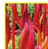
7 Dale Chihuly Cattails and Copper Birch Reeds, 2024