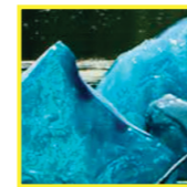
4 Dale Chihuly Blue Polyvitro Crystals, 2024