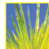
15 Dale Chihuly Vivid Lime Icicle Tower, 2022