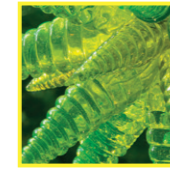
10 Dale Chihuly Chartreuse Hornet Polyvitro Chandelier, 2001