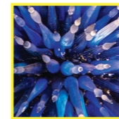
5 Dale Chihuly Sapphire Star, 2010