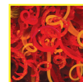
16 Dale Chihuly The Sun, 2014