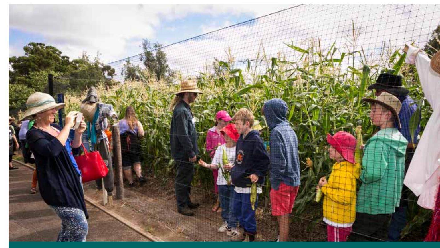
The Foundation worked collaboratively with the Friends on various projects, including the The Great Escape family activity and City Crop, which was supported by ElectraNet.

Activating the Gardens by working collaboratively (and commercially) with on-site leasees Diggers and Blanco (e.g. Heirloom Weekend and Valentine's Day).