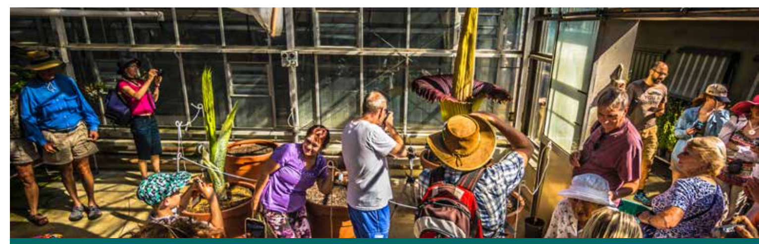
The display of iconic species such as Amorphophallus titanum - which flowered for the first time in South Australia at Mount Lofty and Adelaide Botanic Gardens, connected new generations of people with plants. The three Amorphophallus flowering events attracted around 20,000 visitors in just a few days.