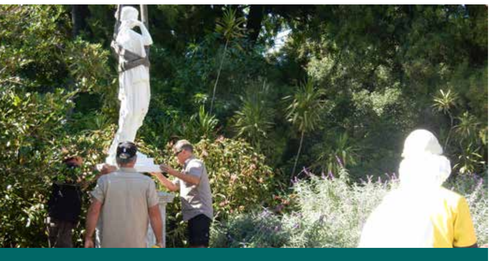
A number of sculptures were restored and relocated, including Venus and Diana (above) and the Owl in Toad Stool in Adelaide Botanic Garden.

Kitchen Garden opened to pre-school and early-years school groups in April 2015 as part of a $1.6 million South Australian Government commitment, over four years, to help inspire SA's next generations of kitchen gardeners.