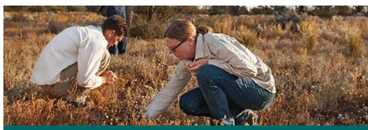
The South Australian Seed Conservation Centre team has 293 taxa collections listed as threatened (96 Endangered, 66 Vulnerable, 131 Rare). South Australia's threatened flora represented in the seed bank is now 74%.