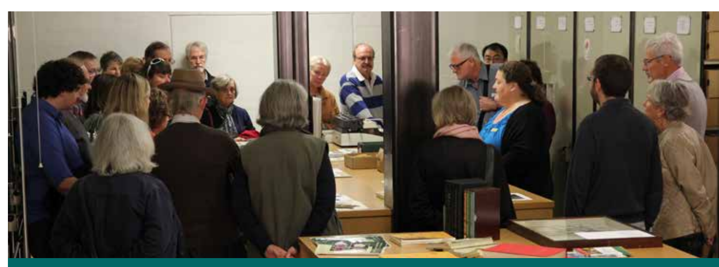
Over 240 talks, presentations and workshops by BGSH staff were presented to DEWNR staff, other organisations, community groups and the general public.

A partnership with the Department for Education at 120,000 school students.